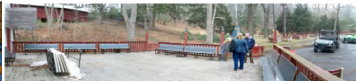
Saniford Hall Porch